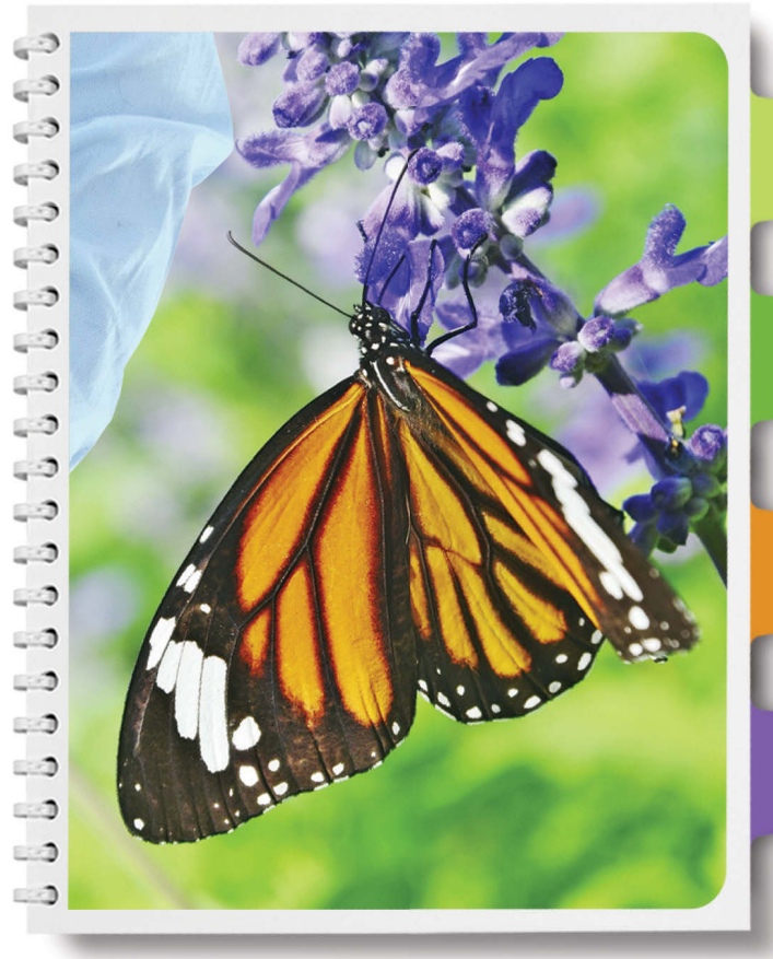
UNLEASH THE FULL POWER OF PRINT.