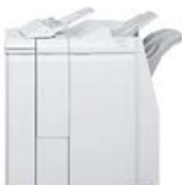
Finisher D4 with Optional D4 Folder