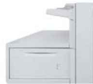
A3 High Capacity Feeder 2,000 sheets: Up to SRA3