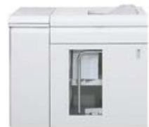
Interface Module and High Capacity Stacker*