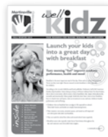
Squarefold Trim Booklet