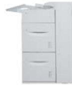
A4 High Capacity Feeder 2,000 sheets each tray (4,000 sheets total): A4-size