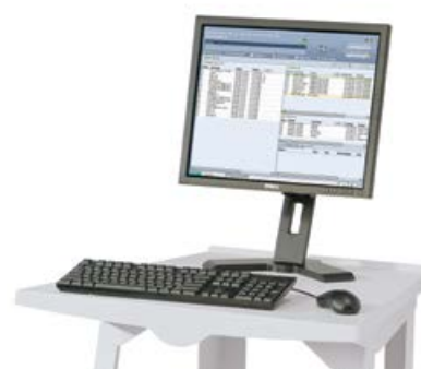
FreeFlow® Print Server