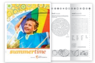
Colour Inserts, Staple and Engineering Z-Fold