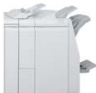
Finisher D4 with Booklet Maker with Optional D4 Folder