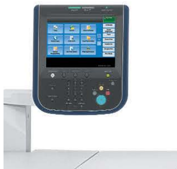
Integrated Copy/Print Server