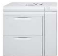
2-Tray High Capacity Feeder C2-DS 3 2,000 sheets each tray (4,000 sheets total): Up to SRA3