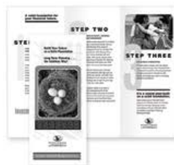
Bi-Fold, C-Fold, Z-Fold