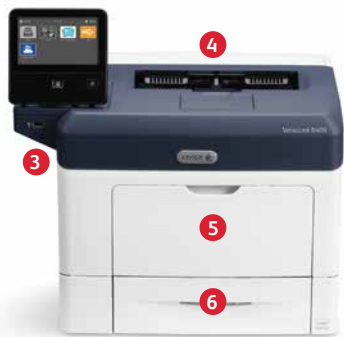
Xerox® VersaLink® B400 Printer Print.