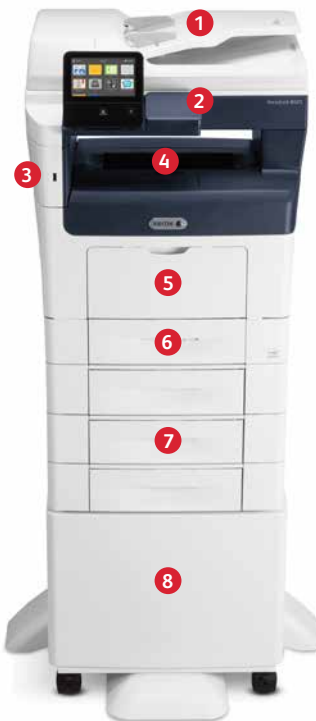
Xerox® VersaLink® B405 Multifunction Printer Print. Copy. Scan. Fax. Email.